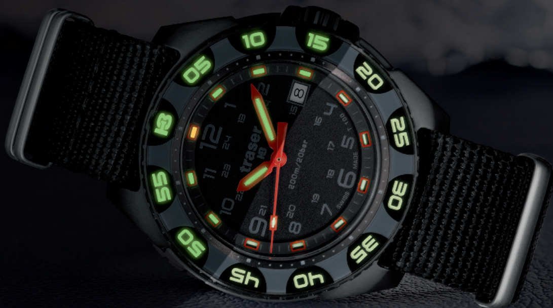
Red Alert T100